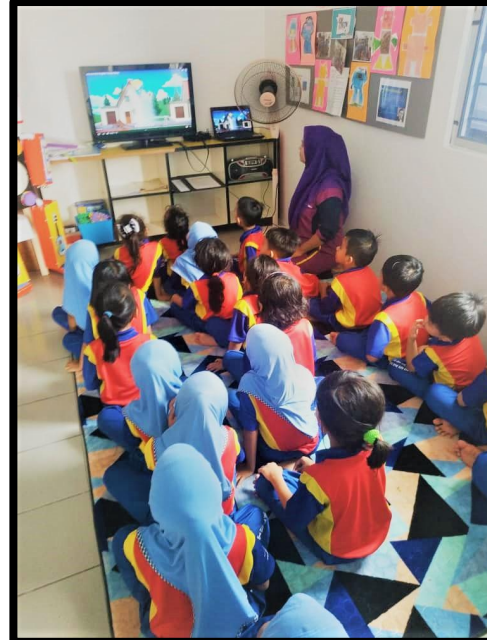
Children watch the video – “Robocar Poli”